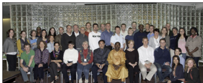
The 2011 Class of Global Outreach

The presenters and participants I met at the Global Outreach course are the amazing people you sometimes read about in news accounts – all too infrequently: the kind of good souls you'd like to be around all the time – whom you hope will rub off on you; a line-up of professionals who've lived lives of service for years, who've exported their skills to the