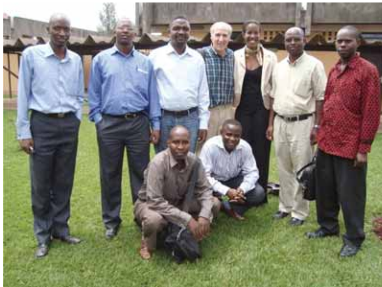
The Rwanda Residents