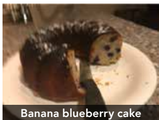
Banana blueberry cake