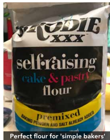
Perfect flour for 'simple bakers'