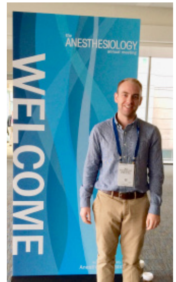
Exploring the conference center at the ASA Annual Meeting

that included social events, workshops, and lectures, which gave us ample opportunities to get to know each other. One of the highlights included a resident regional anesthesia workshop that offered small-group, hands-on ultrasound scanning lead by national experts. As well, I attended the Resident Component House of Delegates' meeting, giving me a glimpse into their governance body, and allowing me to draw parallels between many of the issues we universally face as resident physicians.