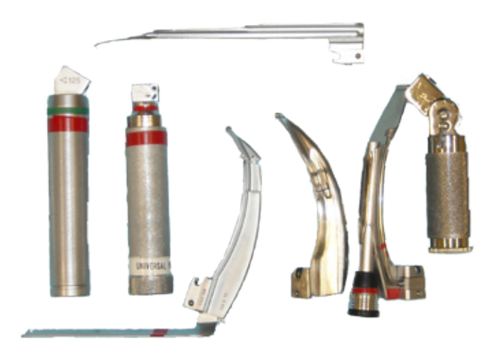
Scopes