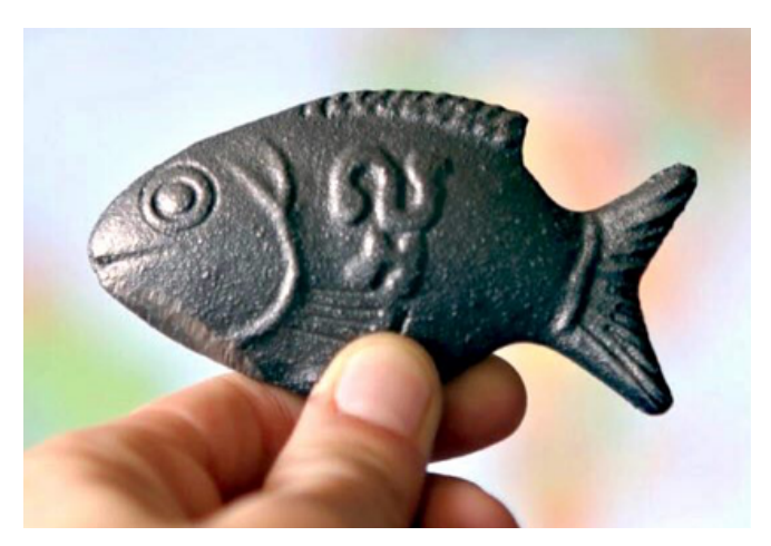
LUCKY IRON FISH

In addition, you will have the opportunity to view the Falls' illumination and fireworks show from this private viewing platform and see the Falls illuminated in the CAS colours for 15 minutes!