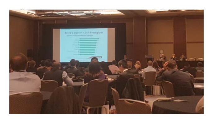
The Annual Meeting focused on important resident issues.

Overall, I found this experience to be rewarding—from the great educational sessions to the fantastic networking opportunities and the venue. Chicago's many historical attractions, restaurants, and ambience ensured that we all left with plenty of good memories and ideas to take forward.