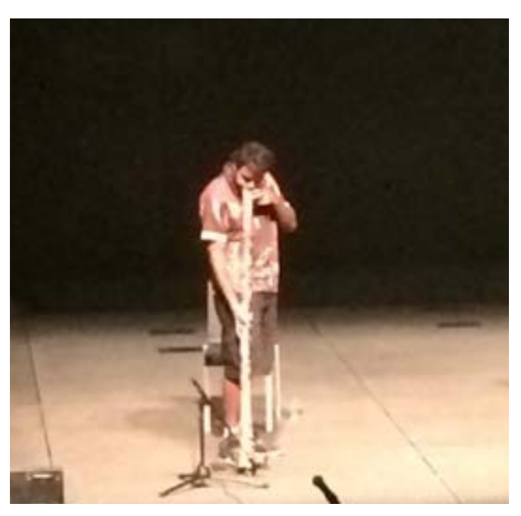
Didgeridoo Performance at the Opening Ceremony