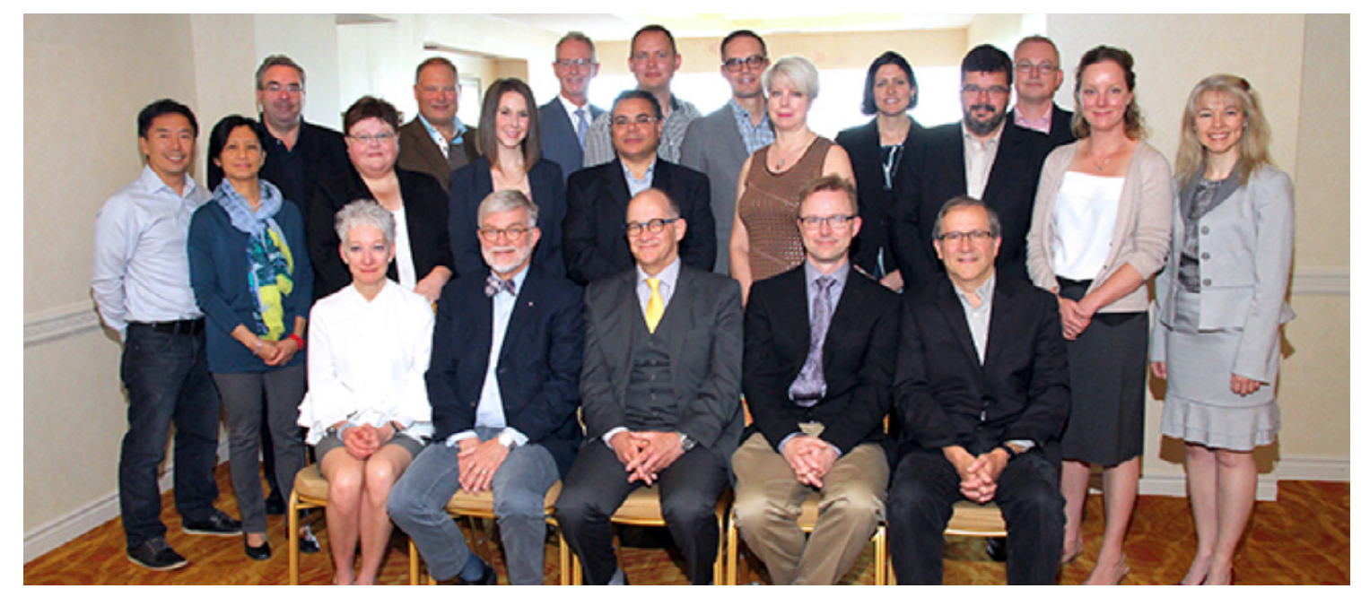
CAS Board of Directors' Meeting, June 27, 2017