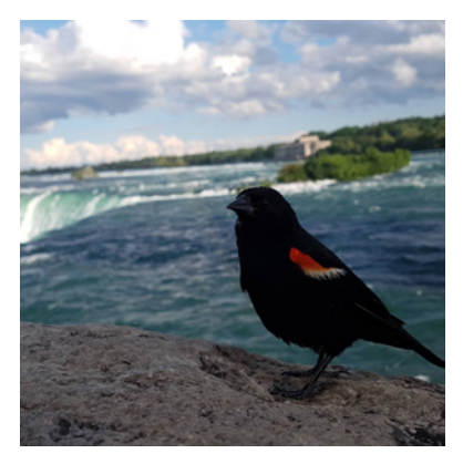
ANTOINE DAHER – Red Winged Blackbird

hank you to all the avid photographers who participated in the photo contest at the 2017 Annual Meeting. Congratulations to the three winners (in alphabetical order below) who each uniquely captured the magical spirit of Niagara Falls with their camera.