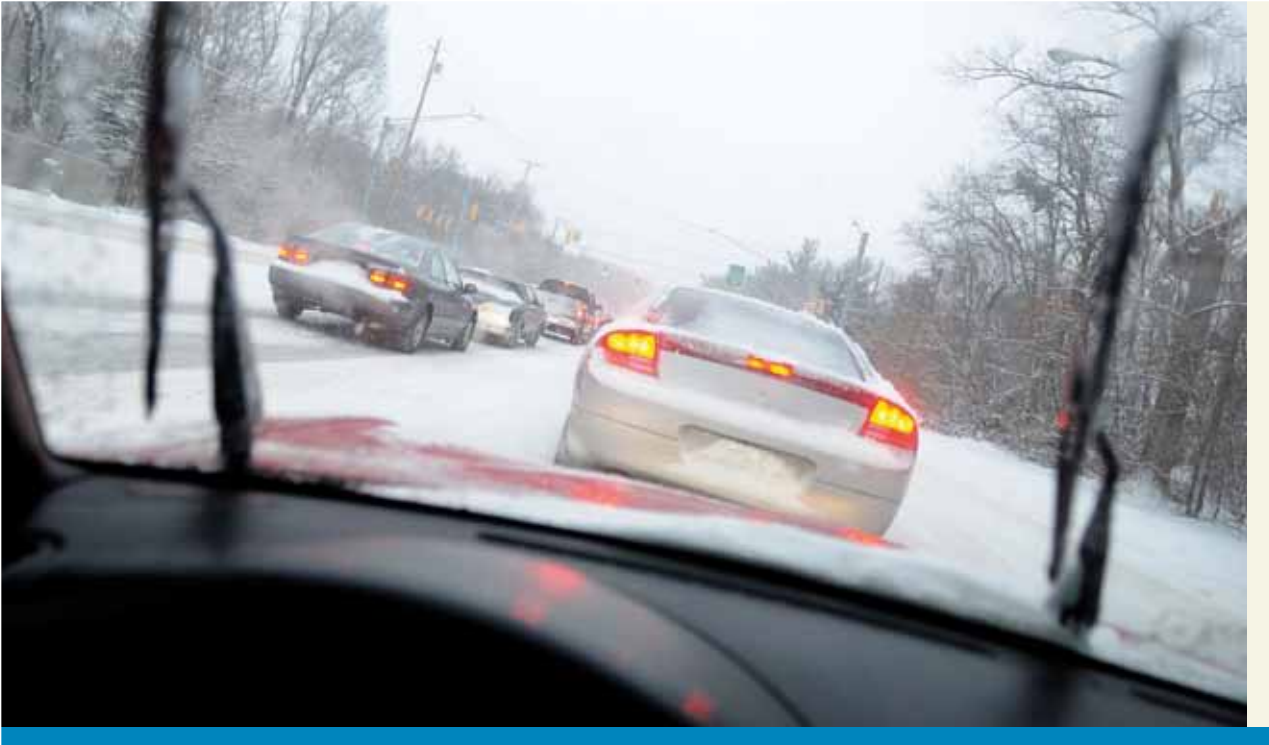
Call From the Scene, 24/7 Should the unexpected happen, we're just a phone call away. If you're in a car accident anywhere in North America, call us and we'll help you arrange for transportation and repairs. We care!