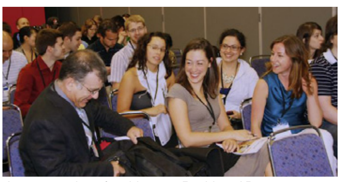
A cross section of residents at Residents' Day